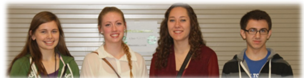
State Math & WYSE Team Members

The 2013-14 school year has been an exciting year, full of new opportunities. We wish the graduates success and look forward to next school year.