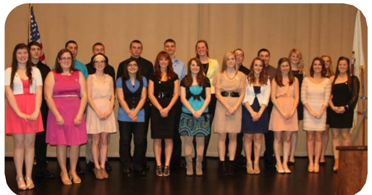
National Honor Society Members—Senior Class of 2013